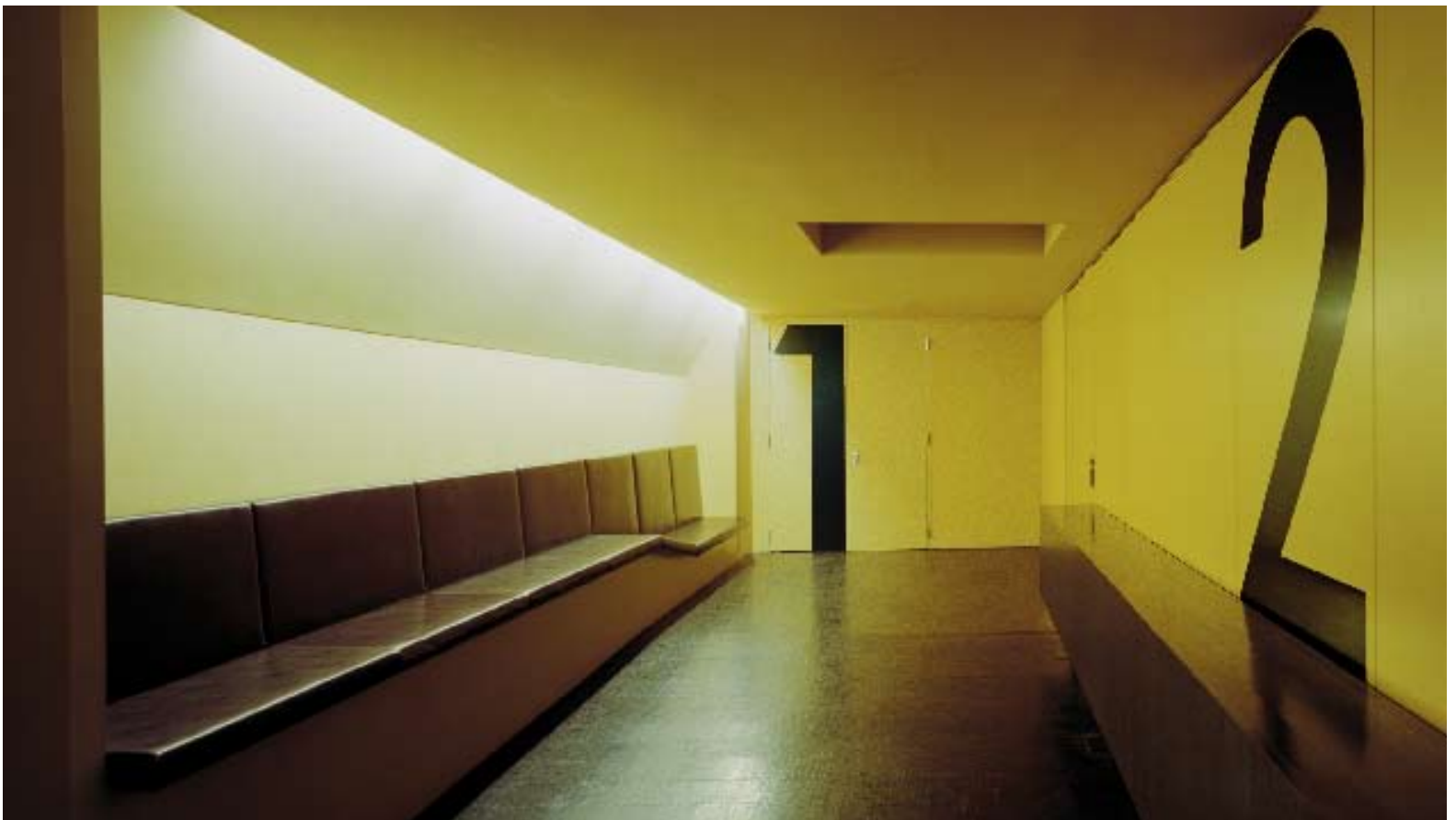
↓ | Foyer