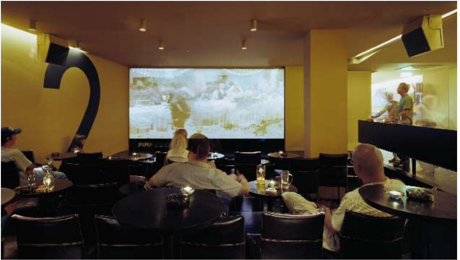
↑ | Beislkino ↙ | Section and floor plan