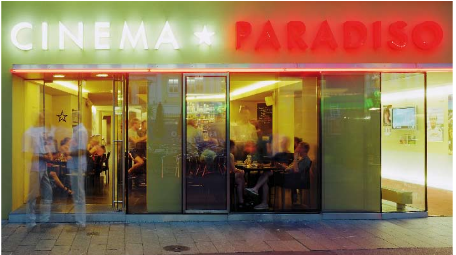
↑ | Front