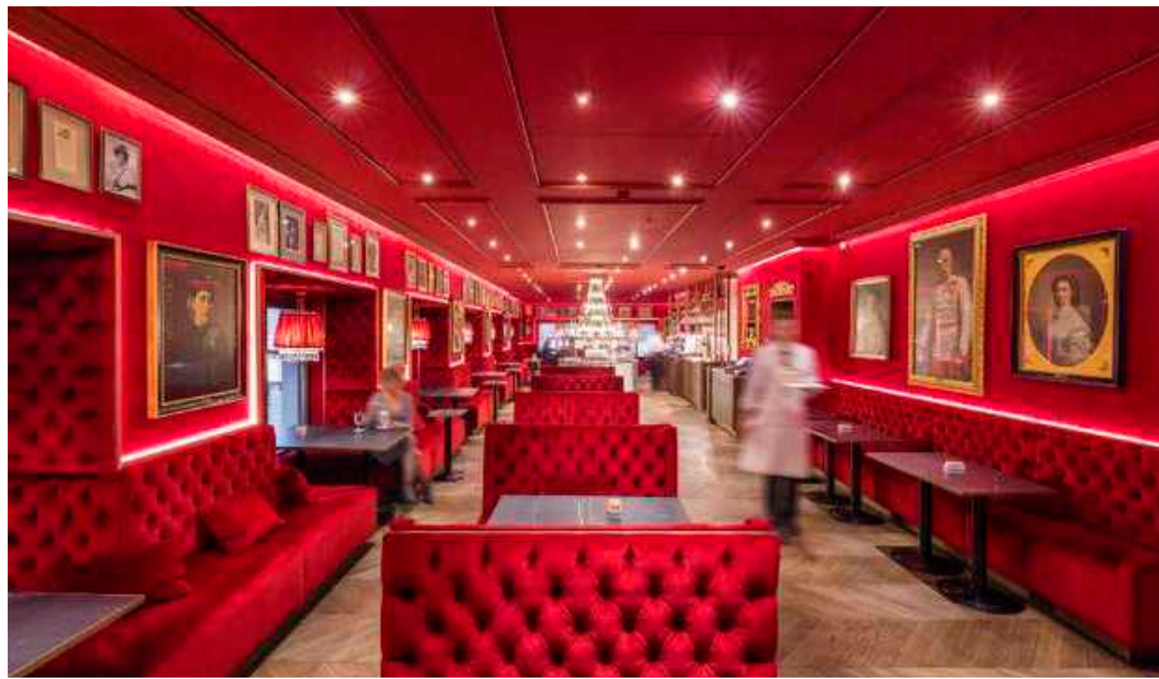
Sacher Eck △