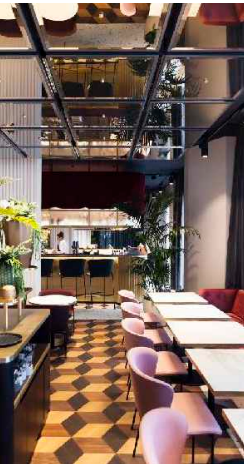
△ Hotel am Konzerthaus MGallery by Sofitel / Restaurant Apron