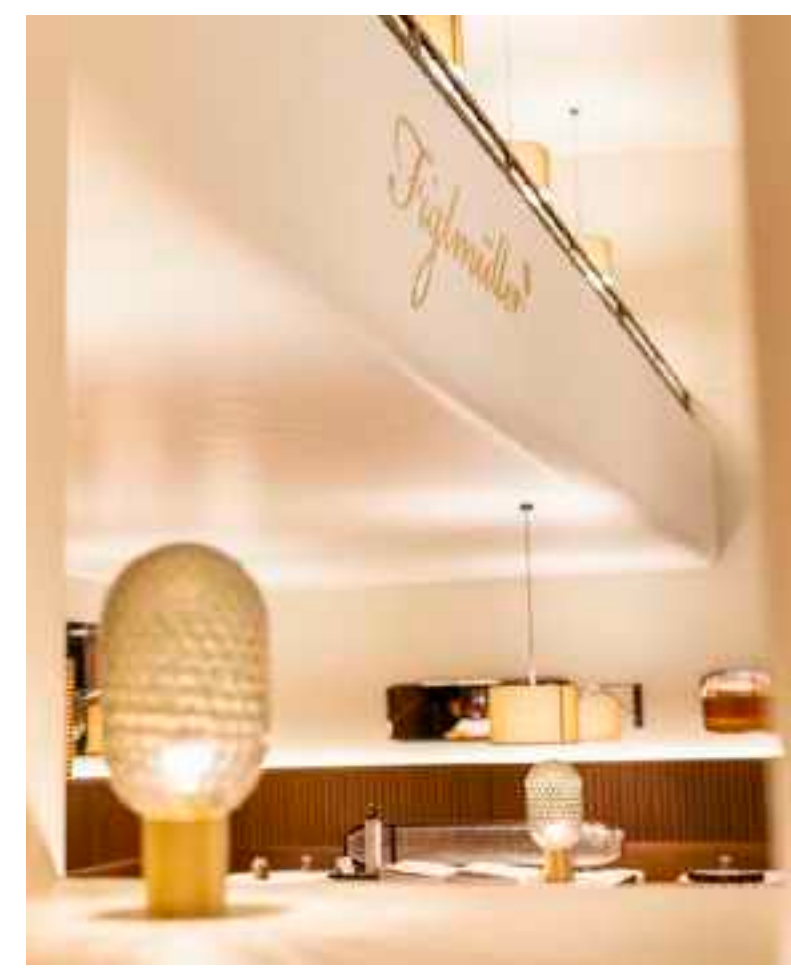
△ Gasthaus Figlmüller Bäckerstrasse △