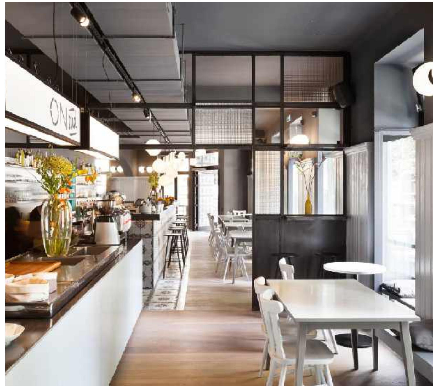
Dingelstedt 3 (form. ON Sud) ▷