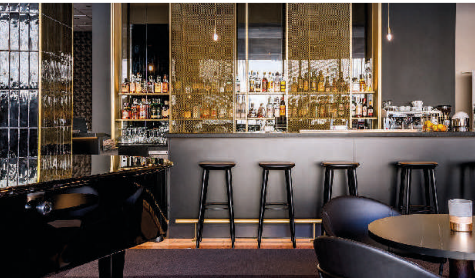
◁ Hotel VH Diplomat Prague