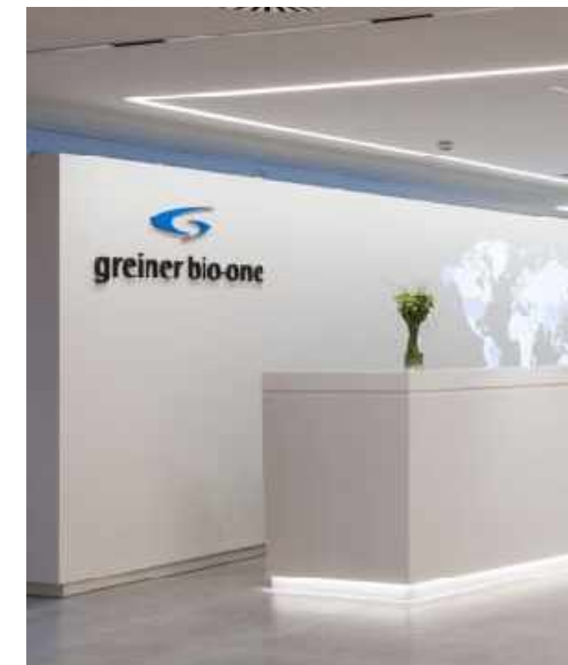
△ Greiner Bio One