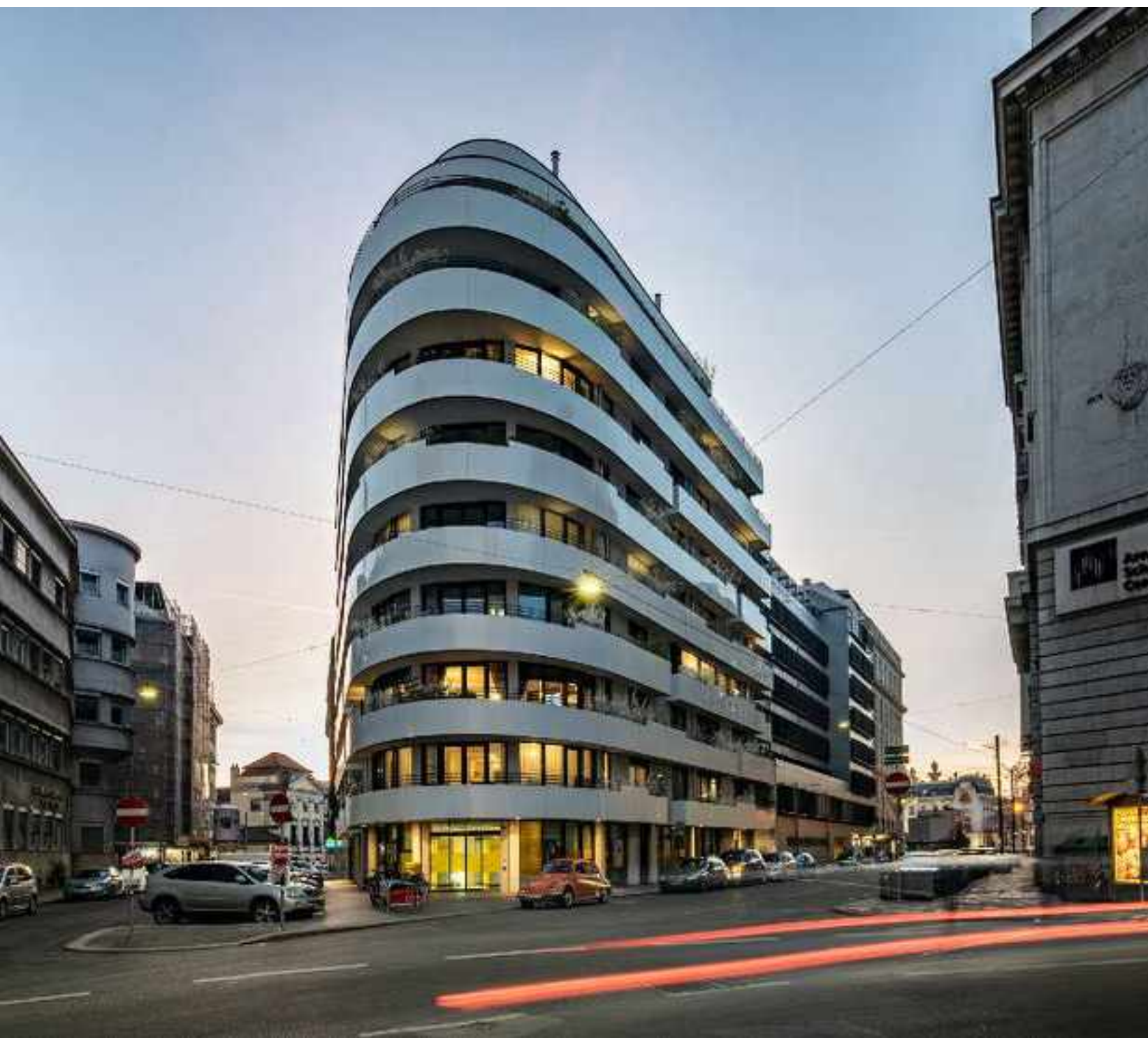
Traungasse 12 △