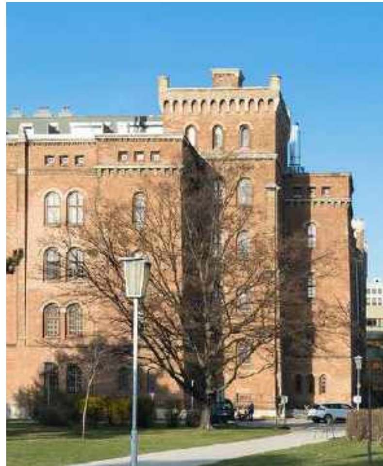
Arsenal, Object 16 △