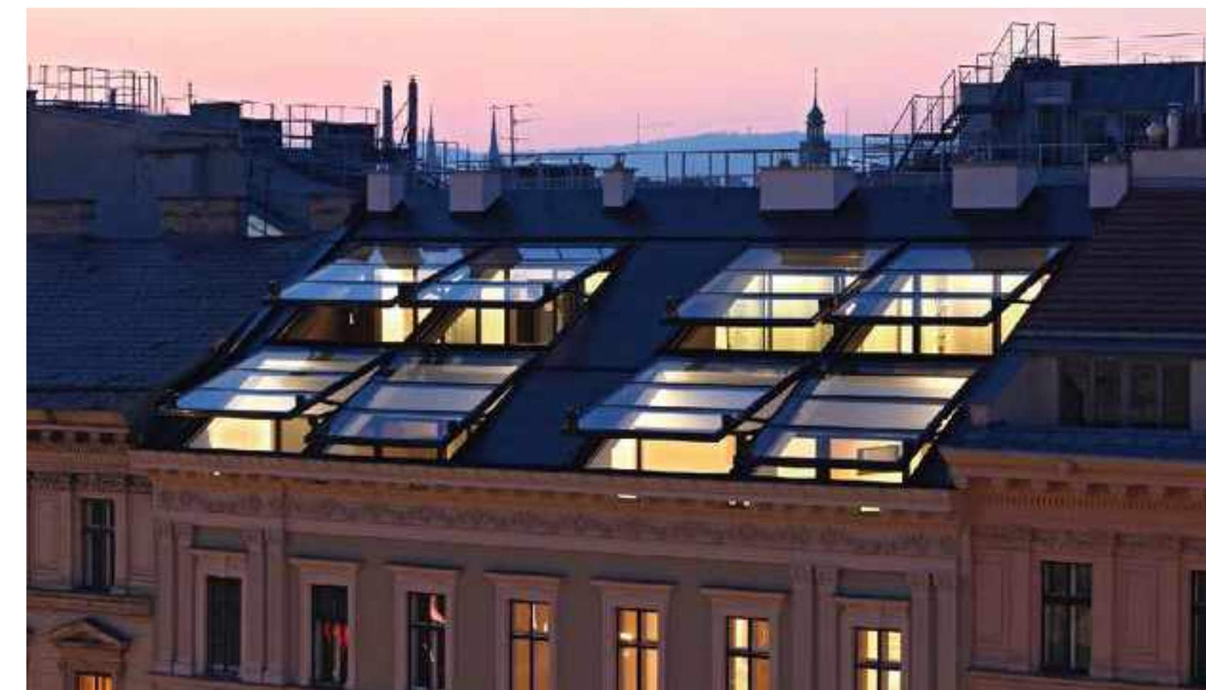
Roof construction Bellariastrasse △