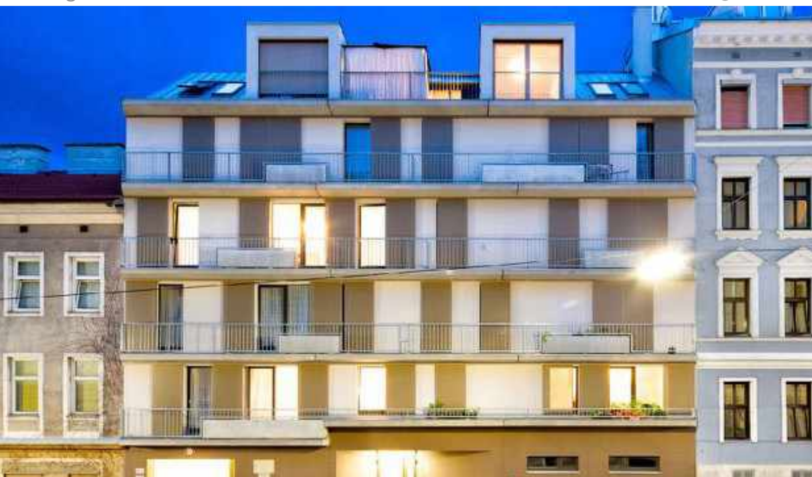
▽ Kreitnergasse 36