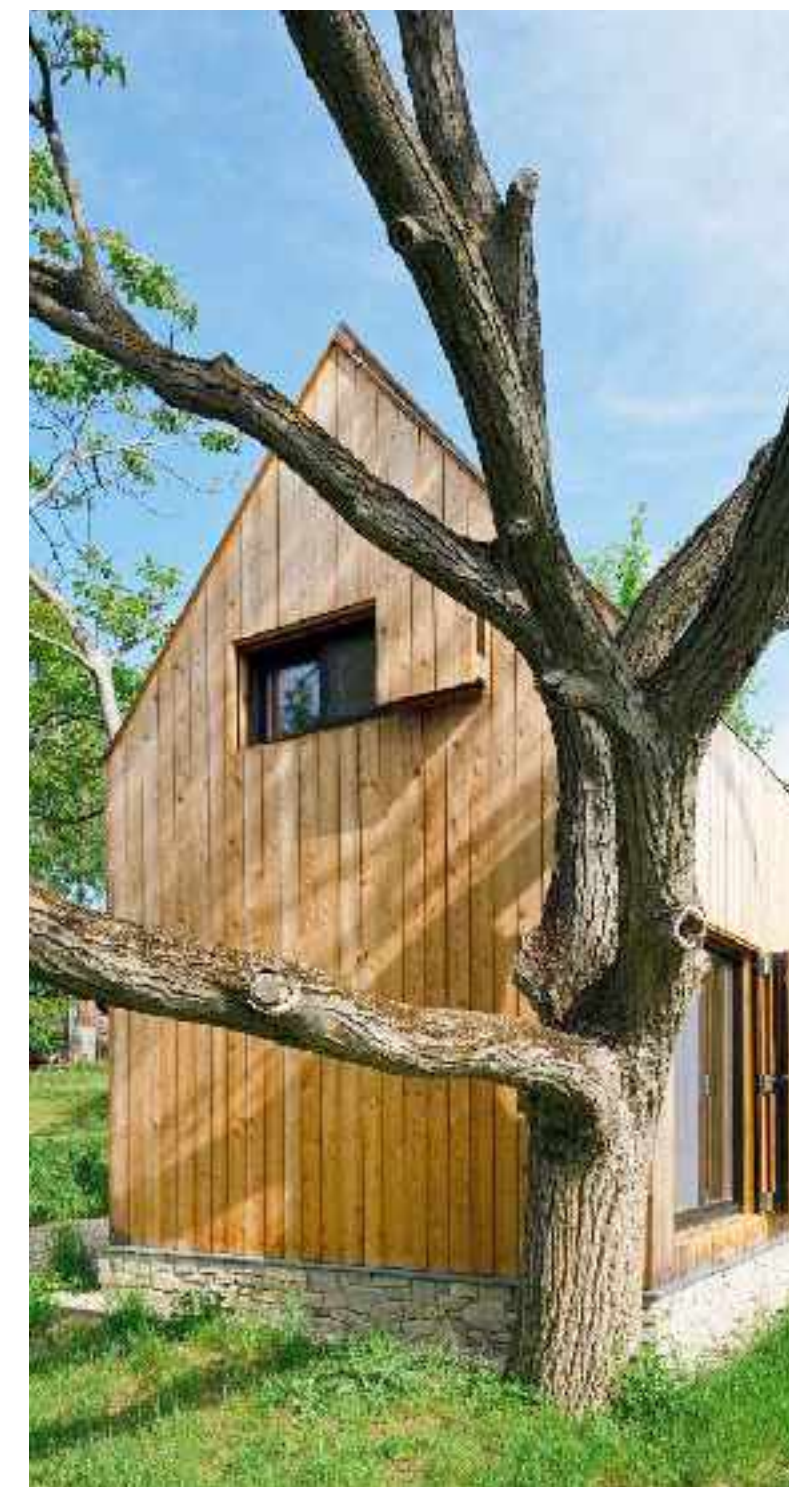
Vineyard cottage in Vienna △