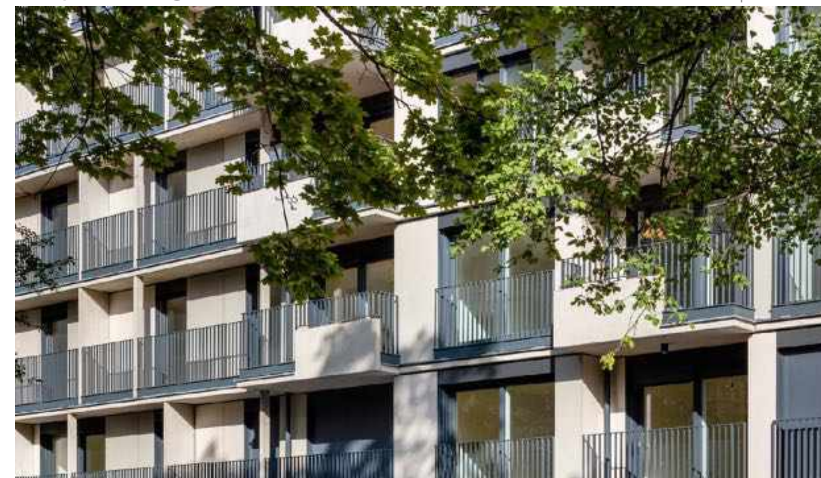
▽ Am Modenapark 1-2