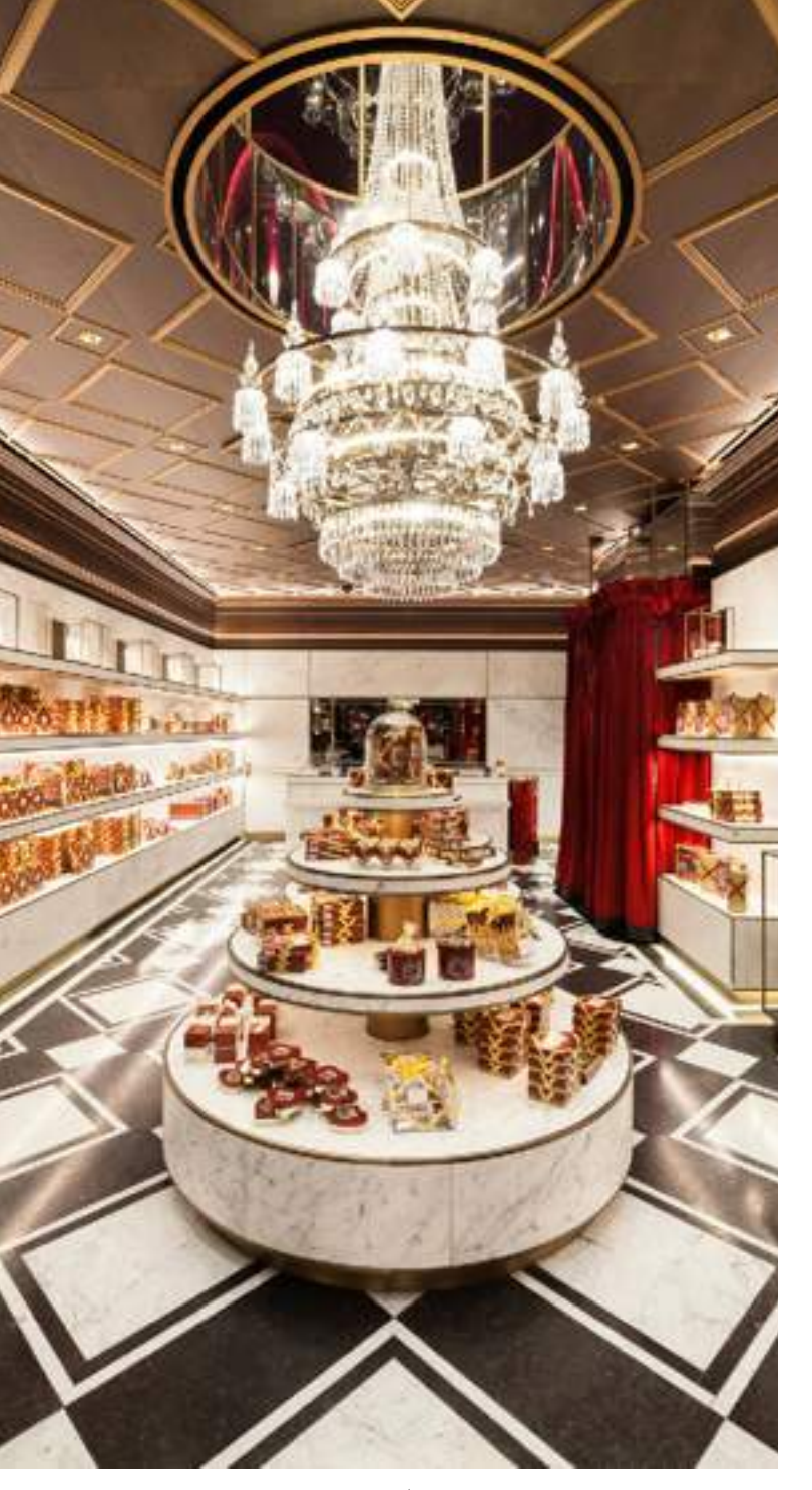
Sacher Eck Wien △