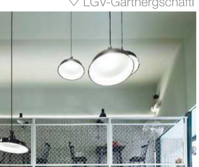
A.E. Köchert Juweliere △