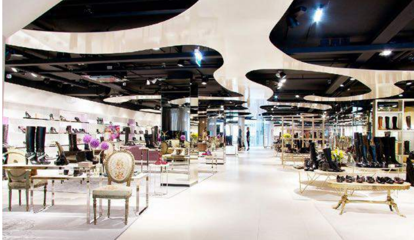
The 6th floor △