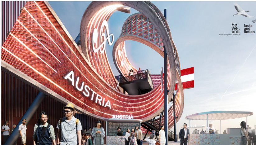
Image of the Austrian pavilion for the 2025 World Expo. (Photo courtesy of Expo Austria/BWM Designers & Architects) (Kyodo)

The pavilion will have an exhibition space of over 200 square meters, with one of the highlights being a room named the Cathedral of the Future, where visitors can play a musical instrument and artificial intelligence will gather those sounds to compose music.