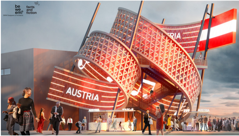
Image of the Austrian pavilion for the 2025 World Expo.

The object that looks like a red ribbon will lead into the pavilion to take visitors on a journey to explore what the Austrian government calls "the diversity and creativity" of the European nation as well as ideas that contribute to responsible and sustainable future development.