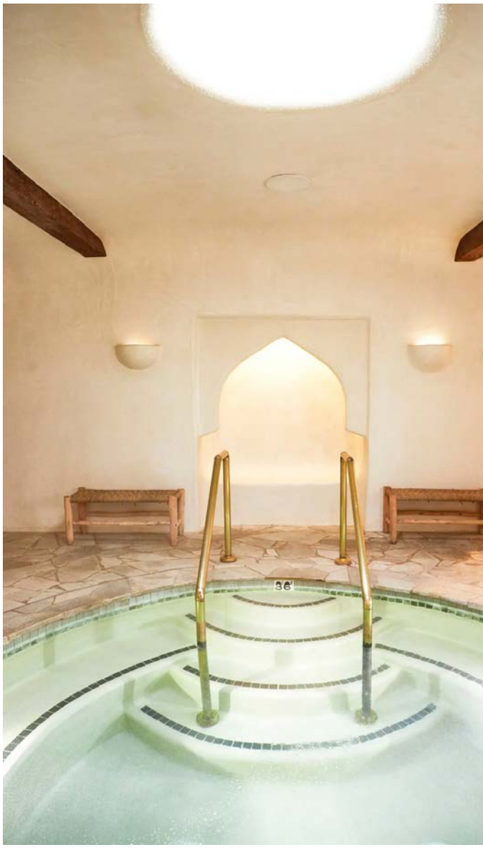
The exterior of the Jacumba Hot Springs Hotel in Jacumba Hot Springs, Calif. Mikael One of the property's three therapeutic pools. Kennedy