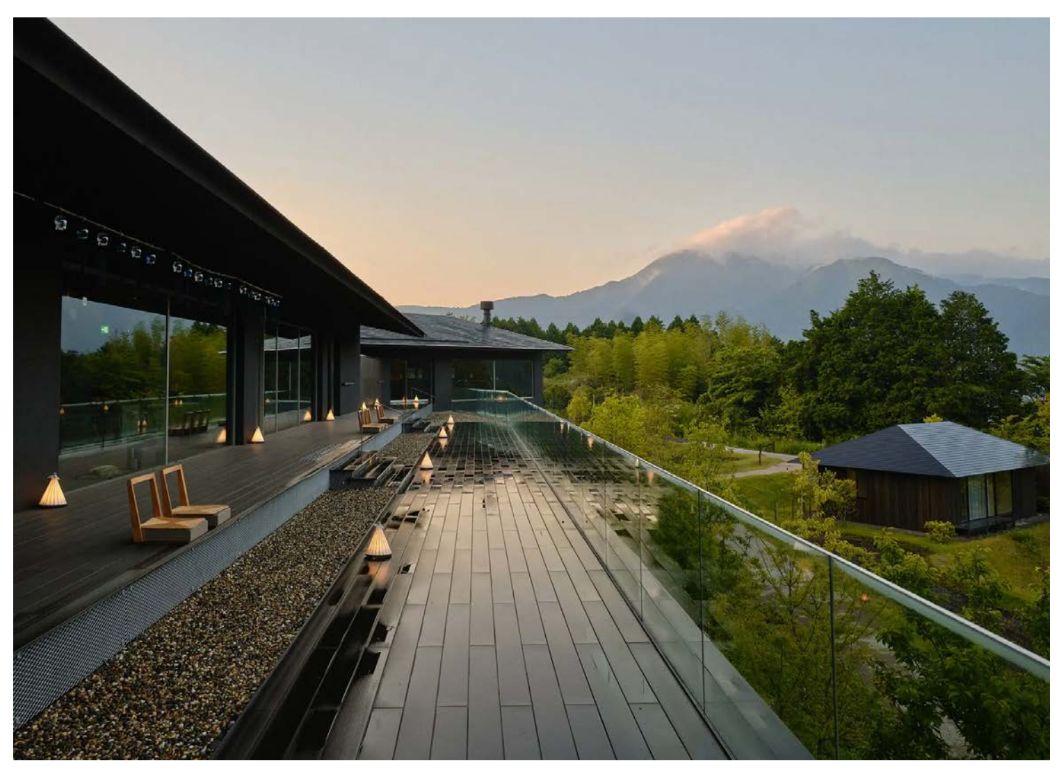
A terrace at the Kai Yufuin hotel.