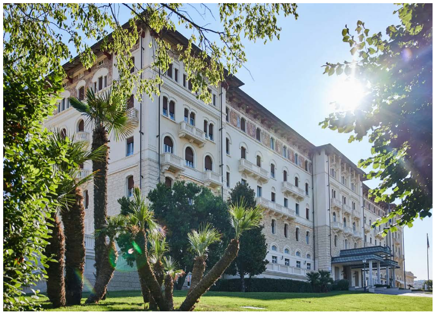
The spa hotel Palazzo Fiuggi in Italy's Lazio region. Tyson Sadlo