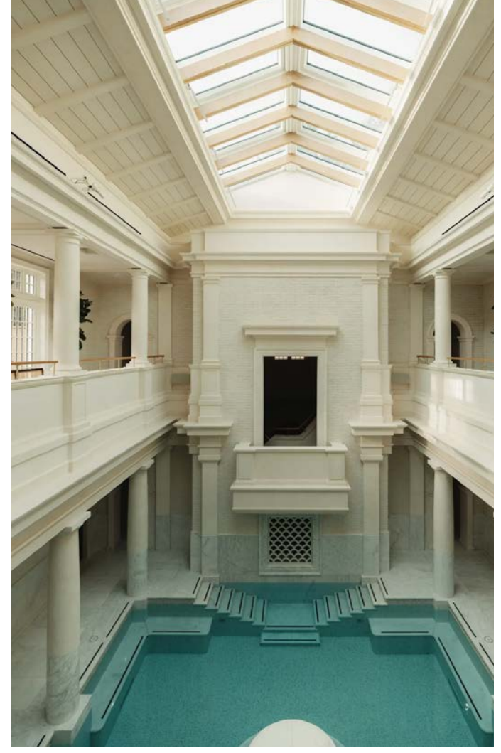
The Eynsham Baths at the members' club and hotel Estelle Manor in Oxford, England.